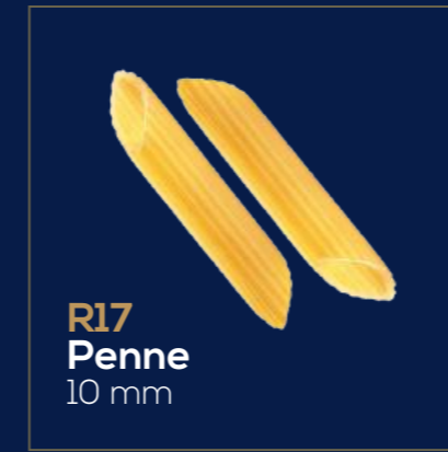
R17 Penne 10 mm