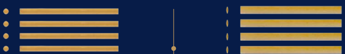
R3 Spaghetti 16 mm