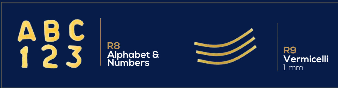
R8 Alphabet & Numbers