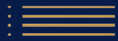
R2 Spaghettini 14 mm