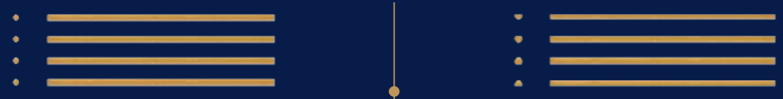
R1 Spaghettini 12 mm