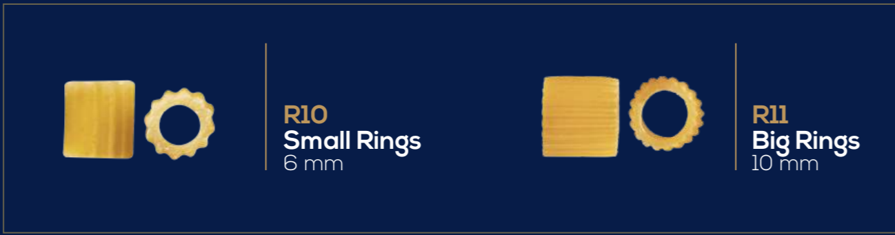
R10 Small Rings 6 mm