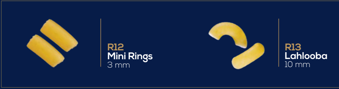
R12 Mini Rings 3 mm