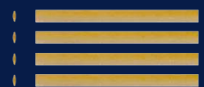
R4 Spaghetti 2 mm